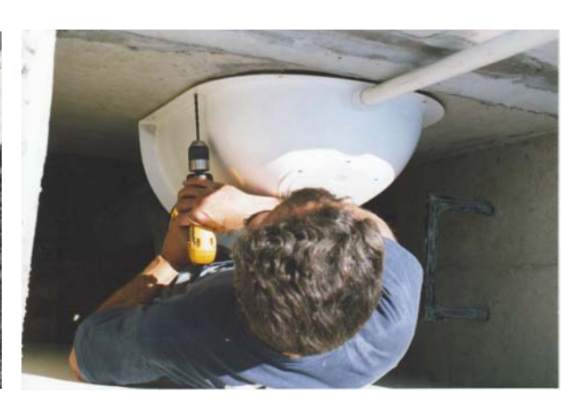
Holes Drilled for Anchor Shields