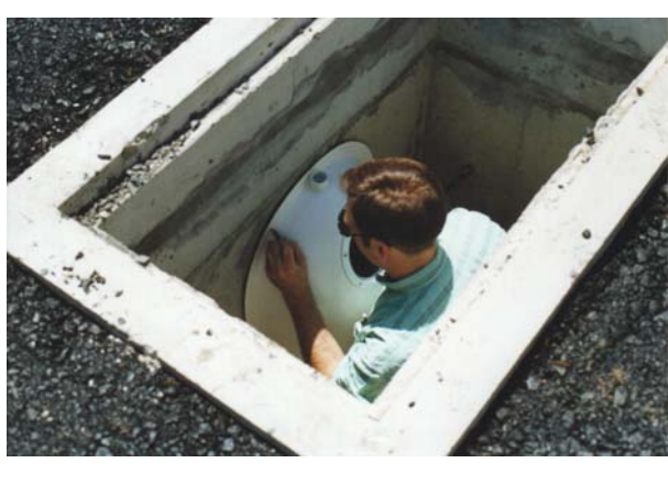
SNOUT is Trial Fitted over Pipe