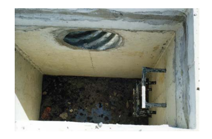
Empty Structure is Prepared