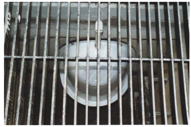
Structure is Ready for Service usually within 1 Hour