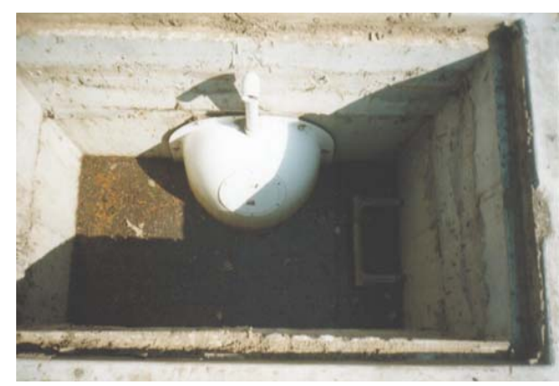
The SNOUT Trapping Floatable Oil and Debris