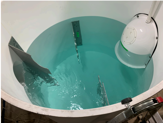
Initial conditions prior to sediment introduction.