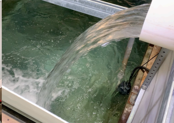
Test flow conditions at 225 gpm.

TP18S at inlet pipe and TP18-90s at 90 degrees and 270 degrees. 18R SNOUT® covering outlet pipe at 180 degrees.